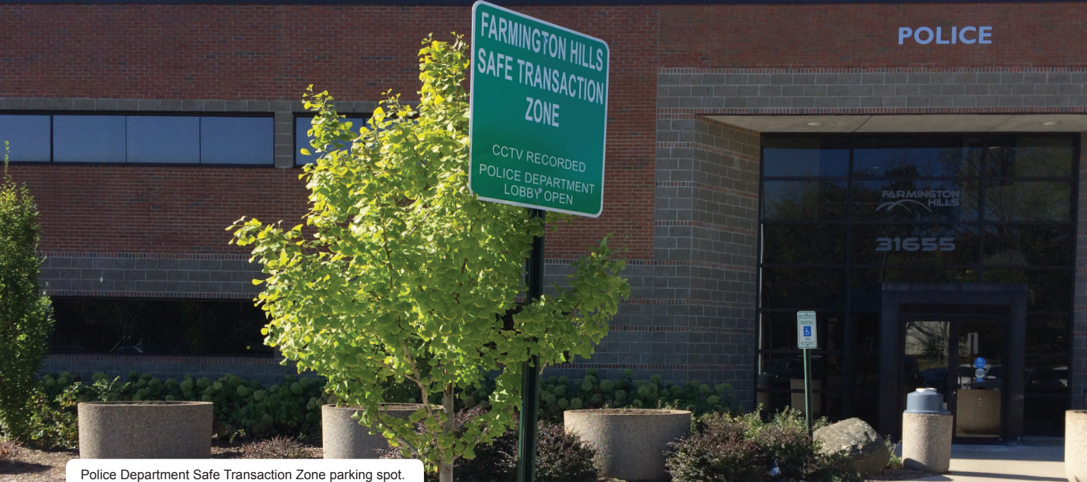
Police Department Safe Transaction Zone parking spot.