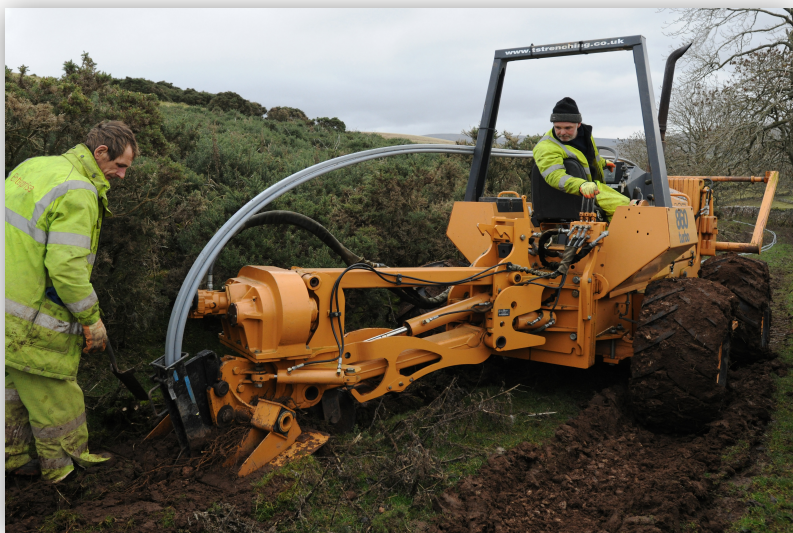
Fiber installation.

Wilson, North Carolina built the Greenlight network in 2008. Two private Internet Service Providers had refused to improve their unreliable services, and the city was looking to strengthen the local economy after the loss of key industries. Wilson used Certificates of Participation, which are similar to revenue bonds, to fund building the network. They now have a network that connects every home and business in the city and provides some of the fastest connections in the country. Greenlight has helped Wilson become an important source of economic growth in the region, with new businesses, including a film production company's special effects studio, coming into town to take advantage of the network.