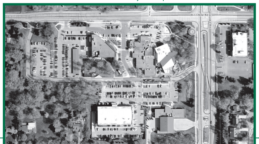
Aerial view of the City Hall campus

The Department of Planning and Community Development, in cooperation with the City's GIS Coordinator, has updated its online Planning Atlas. The Planning Atlas is a collection of maps providing a wide range of detailed information beneficial to developers, businesses, engineers, and residents. Data provided in the atlas includes maps showing topographic contours, aerial photos, zoning designations, and future land use goals from the Master Plan. The most recent atlas updates feature maps showing average daily traffic counts, speed limits, and roadway jurisdictions. The atlas can be accessed via the Quick Links drop-down menu on the City website or directly at http://www.fhgov.com/Services/PlanningAndCommDev/PlanningAtlas.asp .