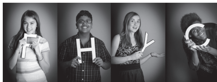
FARMINGTON HILLS YOUTH CHOIR

Enjoy hearing the wonderful voices of the Youth Choir as they perform at Farmington Hills City Hall on Tuesday, December 18 at 7pm. Tickets are $5 and are available at the door.