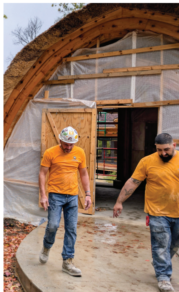
JST Headquarters at 12 Mile

These corridors aren't just roads—they're gateways to opportunity. Whether you're an investor, entrepreneur, or resident, Farmington Hills is paving the way for exciting growth.