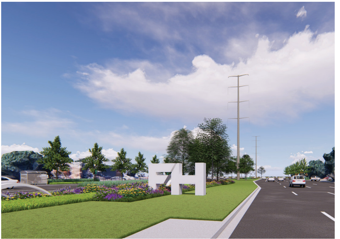
Rendering of the re-imagined Grand River Corridor

Did you know Grand River supports a retail trade area of 120,000 residents and 45,000 workers? With roughly $1.2 billion in retail spending, the Grand River trade area is ripe for retail and restaurant expansion. The city is also investing in beautification and pedestrian connectivity, creating a more inviting environment for visitors and businesses alike.