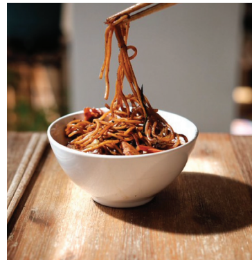
Fung Mee Mein Noodles by richardsu

This corridor is a magnet for retail and dining, with strong demand for restaurants and specialty services. Its strategic location makes it a prime spot for businesses looking to tap into a well-connected, high-traffic area.