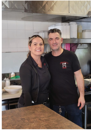
Farmington Diner Owners

Farmington Hills is home to three vibrant corridors—each offering unique opportunities for growth and innovation.