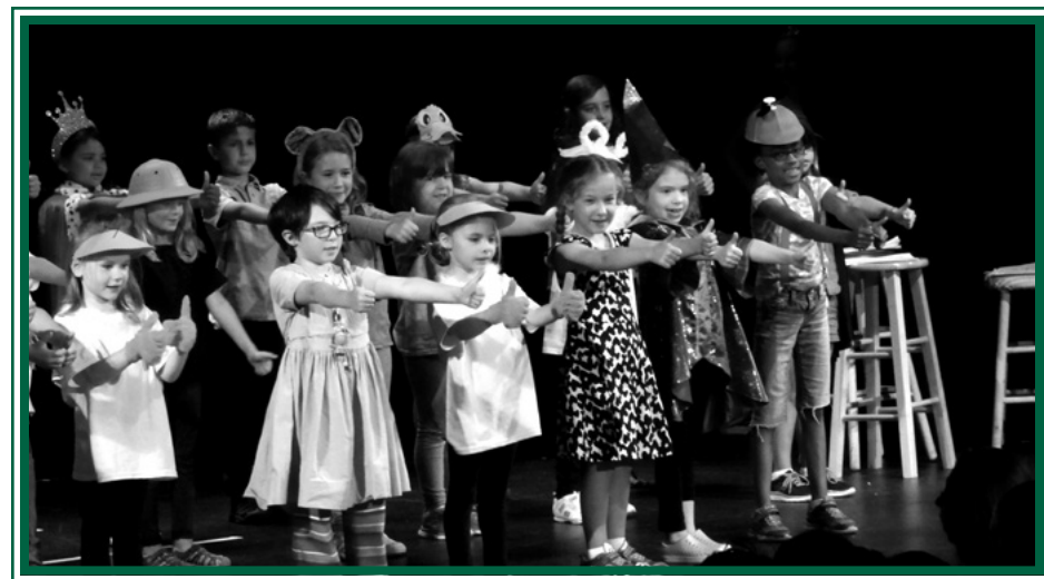
Rising Stars Theater Camp