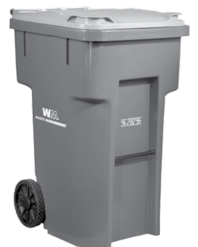
No plastic bags, styrofoam or shredded paper are allowed in recycling carts.

Questions? Call the DPW at 248-871-2850 or visit www.fhgov.com .