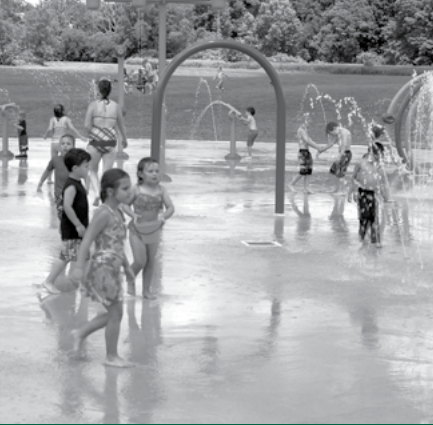
The Heritage Park Splash Pad, which features over 100 jets and sprayers, opens May 27.